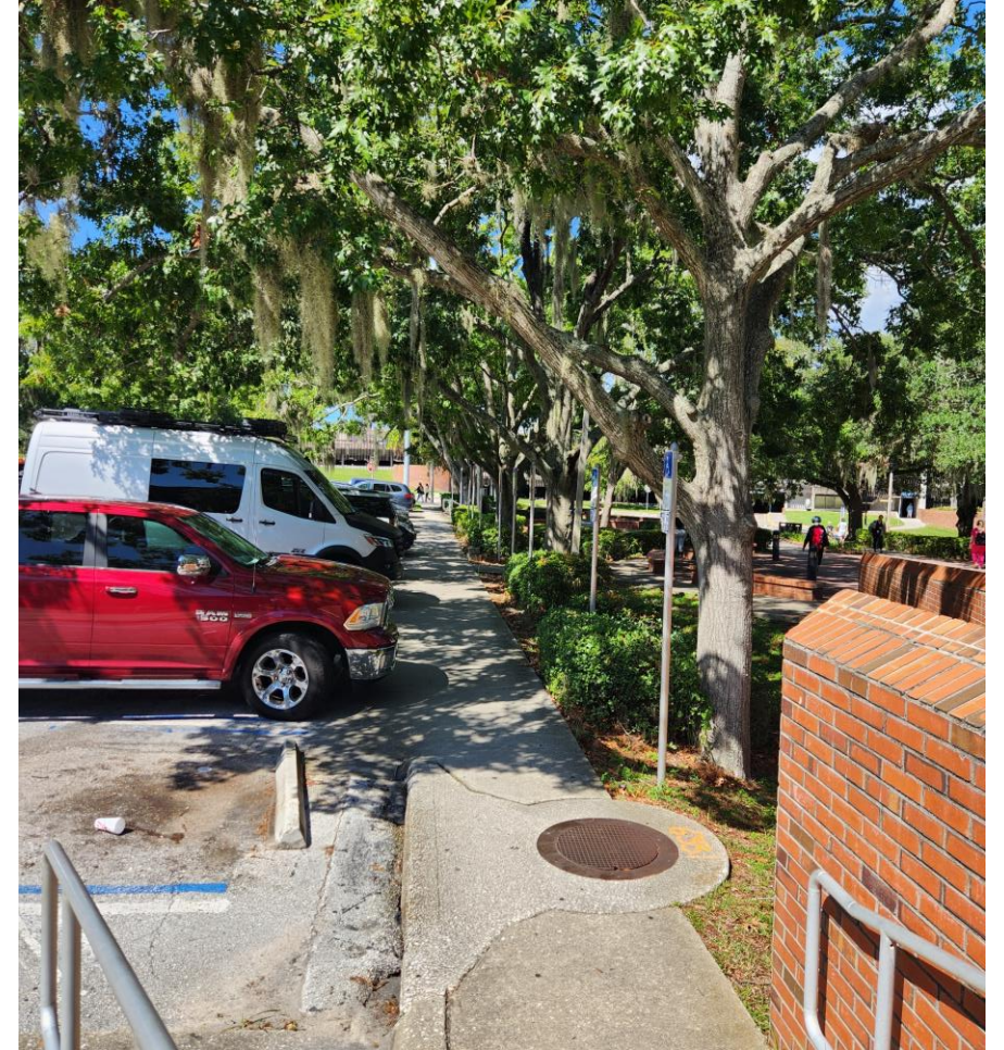
Shumard Oaks – At north edge of parking, south of main walkway