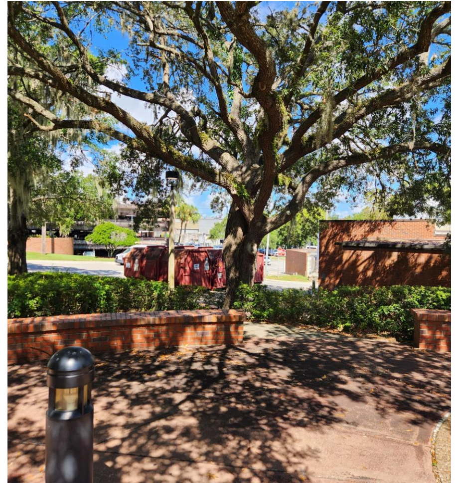
Tree D - At north edge near Loading Dock Retaining Wall