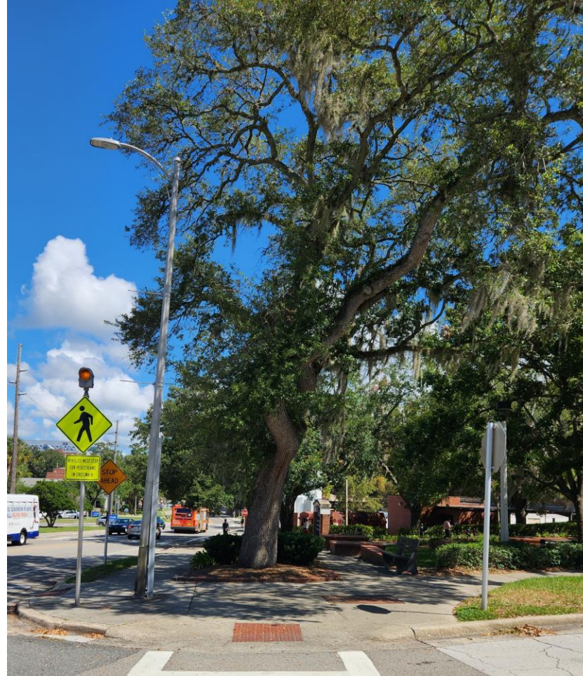
Tree A - Along Center Drive - North of Parking Access