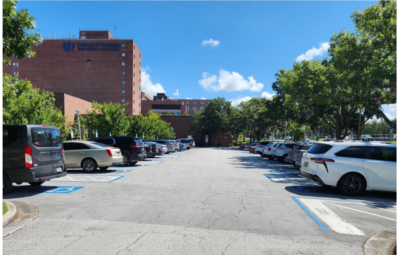
Looking East at a Potential Addition Location