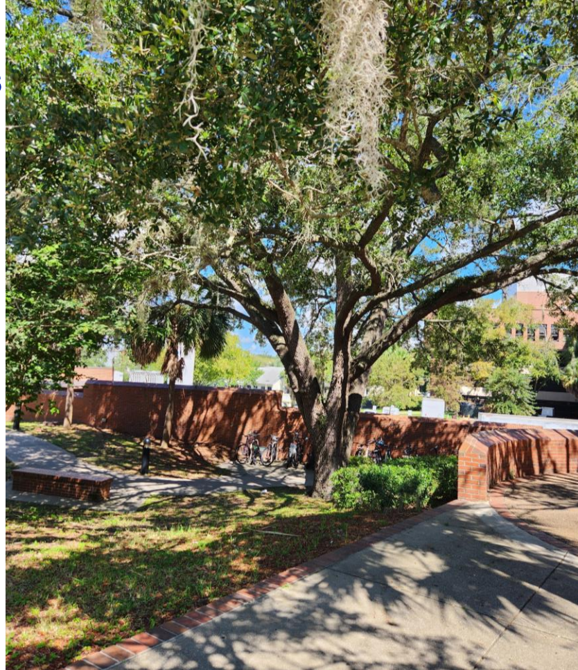
Tree E – At north edge near bike racks and retaining wall