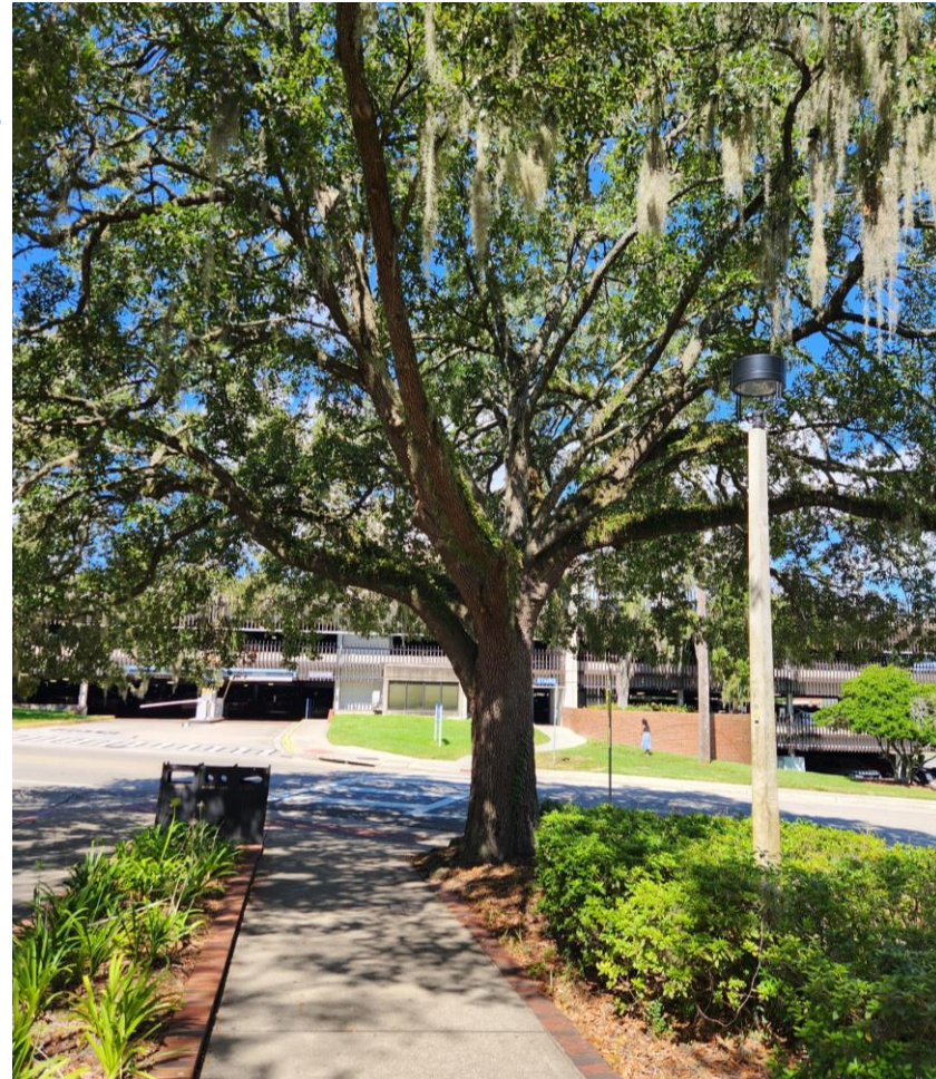
Tree C - Along Center Drive at Main Walkway